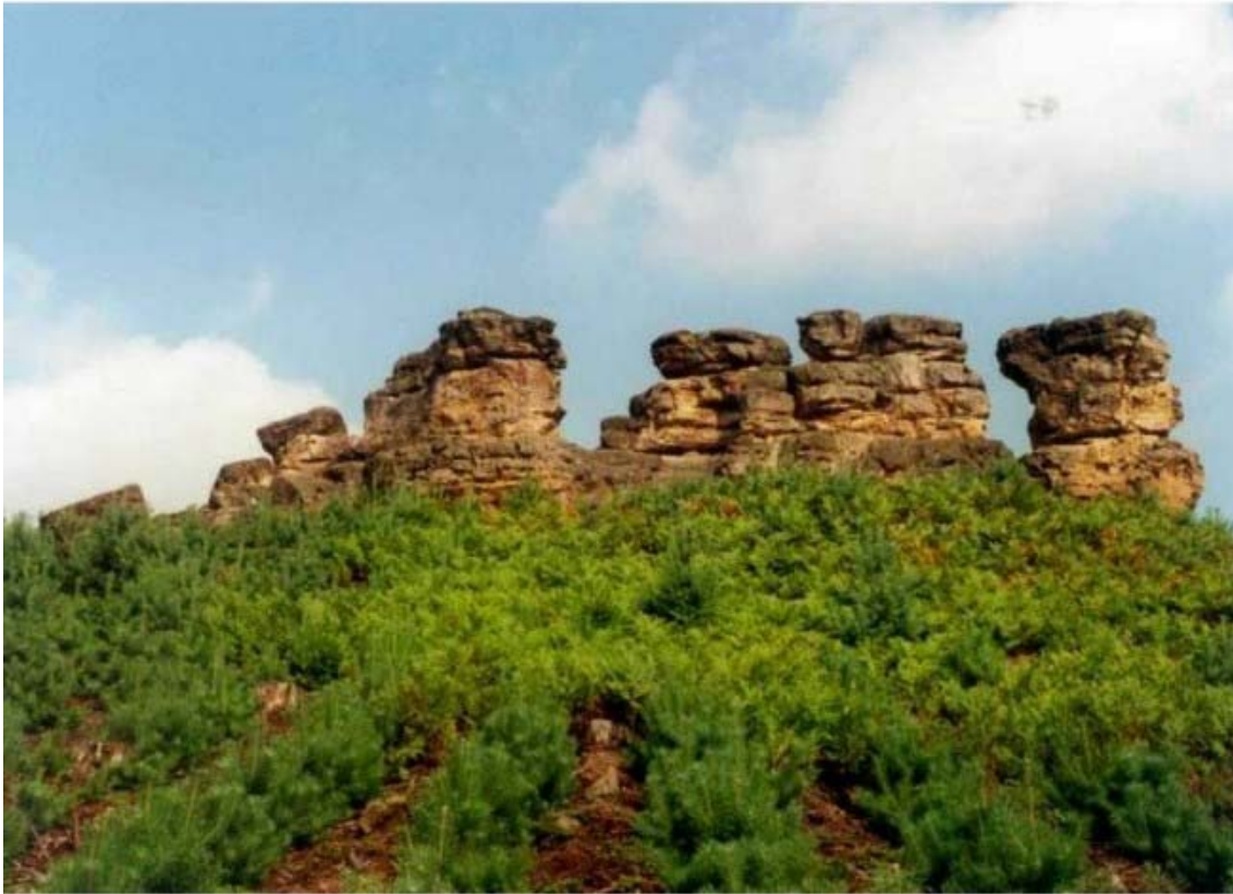
Figure. 2. Mesozoic sandstones in Hradcany, Northern Czech Republic. The layer is a basic unit of geological time. The basic concept is that the lower layer is older than the upper one.

Nearly two centuries later science merged some of the ingenious ideas of both uniformitarianism and catastrophism. Some processes forming Earth's face developed in the course of its geological history. Both the lithosphere and atmosphere and, later, the hydrosphere developed substantially until the early- to mid-Palaeozoic when plants and animals invaded landwards on a massive scale. Entirely different endogenous and exogenous conditions formed the very distinctive rock suites of the Early Proterozoic and Archaean ages. Evolution has even been considered in terms of geological processes forming Earth's surface and interior.