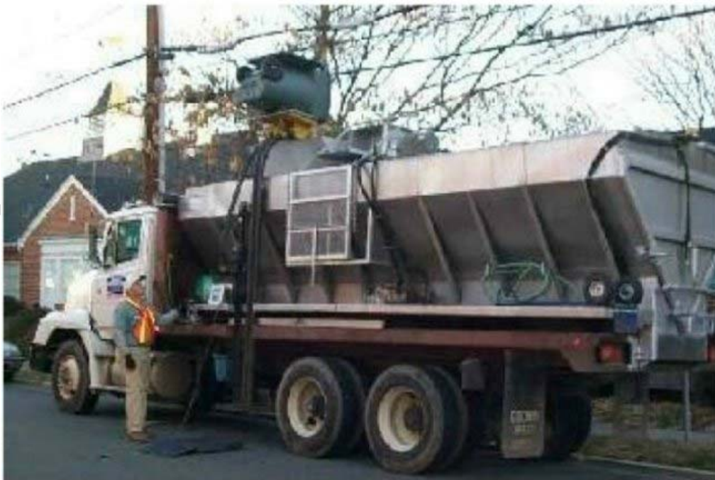
Figure 1. Household food wastes being collected for transfer to central composting facility.

Food industries processing agricultural produce generate compostable wastes, although possibly the most difficult to process are solid wastes and waste waters from vegetable oil extraction presses. Treatment of solid wastes arising from slaughterhouses and meat-packing facilities also represent a special problem since this waste material is almost devoid of carbohydrate material, and yet is rich in fat and protein. With these wastes, every care is needed to facilitate controlled bio-oxidation and to avoid anaerobic putrefaction (Figure 1).