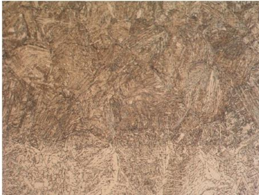
Figure 2. Typical coarse grained martensite and bainite microstructure in MMAW underwater wet weld [18]

structures are locally formed right along the fusion line. The width of this intermediate belt does not usually exceed 0.5 mm. This intermediate layer in the welded joint greatly increases the danger of the incidence of cold cracks due to the structural brittleness of this layer and the maximum hydrogen concentration in this area after welding. Since the diffusion coefficient of hydrogen in martensite is low, the diffusion of hydrogen from the weld metal is considerably higher than the diffusion of hydrogen further into the base material. Martensite thus acts as a barrier preventing the diffusion of hydrogen. Typical underwater wet welding steel microstructure is presented in Figure 2. It presents fusion line with coarse grained high temperature heat affected zone with visible martensite and bainite constituents.