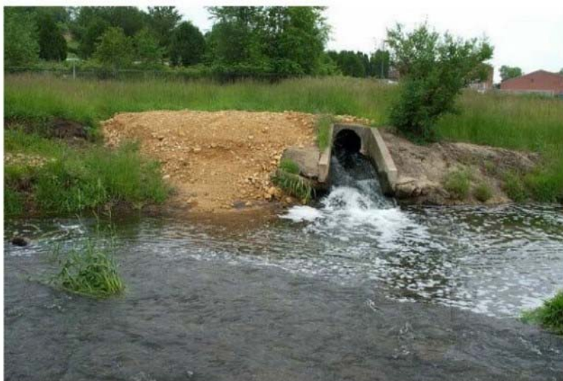
Figure 1: Treated domestic wastewater being discharged into a stream

Biochemical oxygen demand (BOD) is also sometimes referred to as biological oxygen demand, but the latter term is considered inappropriate by many scientists and engineers. These terms are widely used to define the microbial use or consumption (i.e. demand ) of oxygen during the aerobic oxidation of electron donors such as readily degradable organic carbon (e.g. sugars) and ammonia in waters as shown in the following simplified reactions: