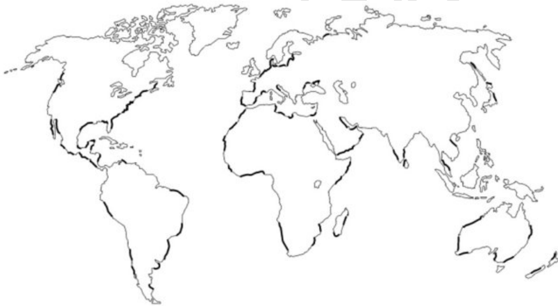
Figure 1. World distribution of major dune and beach areas. The marked sections of coast mainly relate to the occurrence of long and straight beaches. Spatially-constrained embayed beaches are not indicated.

A sandy beach can be defined as a wave-lain deposit of primarily sand-sized material found along marine, lacustrine and estuarine shorelines. In the vernacular, the beach relates to that part of the shore profile that extends from spring low tide level to some physiographic change such as a cliff or dune field, or to the point where permanent vegetation is established. From a morphological point of view, however, the part of the nearshore profile that is regularly affected by surf zone processes should be considered part of the beach.