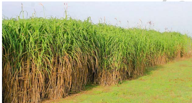
Figure 2. Miscanthus giganteus is a rhizomatous grass that can be grown in very dense stands, here at Woburn Experimental farm, Rothamstead Research, UK

Although having evolved in regions experiencing warm temperatures and high precipitation, Miscanthus has been grown successfully in temperate regions and has demonstrated an above ground tolerance for light frost conditions. Leaves and shoots are destroyed below approximately -5^{\circ}\text{C} , but the plants can overwinter as rhizomes at considerably lower temperatures. In comparison to most crops native to temperate climates, the temperature requirements to break winter dormancy of the tested Miscanthus genotypes are very high, which strongly limits productivity in temperate regions by means of greatly delayed spring emergence and growth. Delayed spring growth in combination to frost sensitivity are likely to be the major limiting factors for Miscanthus culture in environments with short growing seasons and cold winters.