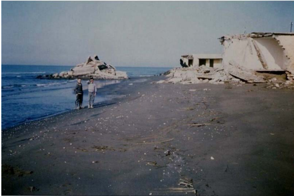
Figure 2. Beach erosion and encroaching sea on the deltaic coast of the Seman River, Albania

Lateral erosion may be often the dominant mode of land loss when sea level is rising. Offshore sediment supply is depleted since the culmination of the postglacial transgression and fluvial sediment supply has been curtailed as a result of dam construction in recent times.