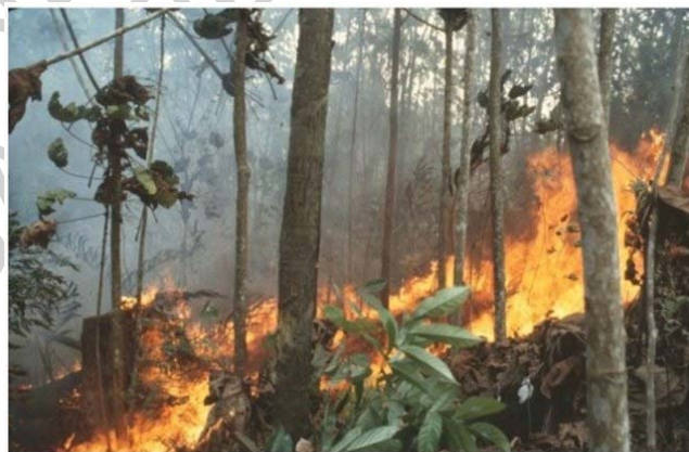
Figure 4. Surface fire in a lowland tropical rain forest of East Kalimantan. This forest became extremely dry and flammable during the 1982-83 and 1997-98 droughts caused by the El Niño-Southern Oscillation (ENSO).

During the extended droughts of 1982-83 and 1997-98 which were caused by the El Niño-