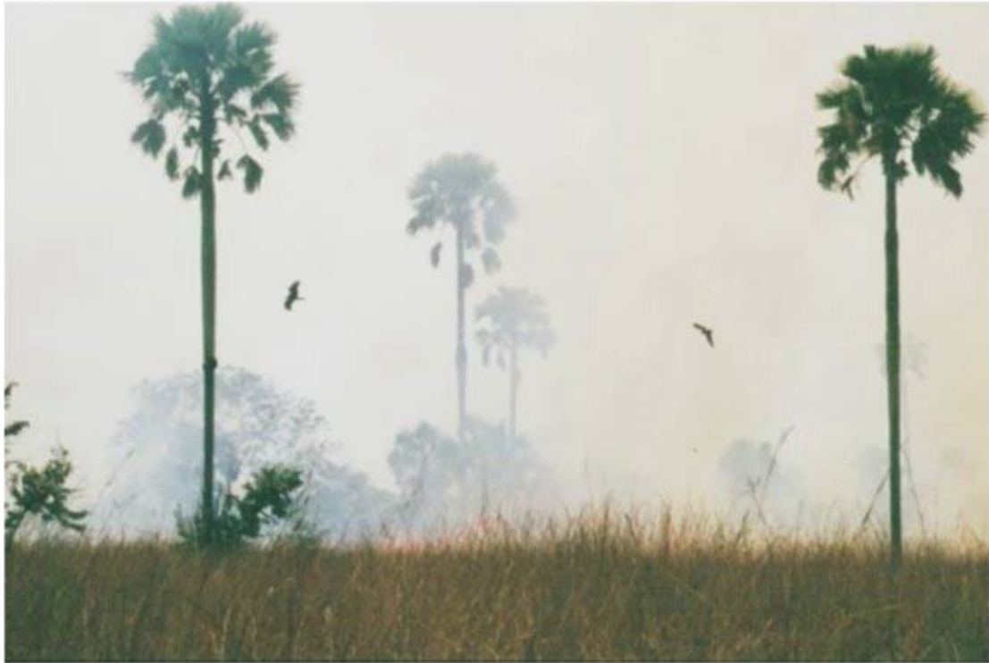
Figure 6. Many of the tropical humid savannas are long-term stable fire climax ecosystems. The photographs show a humid "Guinean" savanna type in Côte d'Ivoire (West Africa) which are subjected to regular fire influence. The extreme fire tolerance of palms (here: Borassus aethiopum ) is a pantropical phenomenon. All faunistic elements are adapted and even attracted to fire, e.g. the birds (here: Milvus migrans ) which are feeding on insects and small mammals fleeing the fire (Photo: J.G.Goldammer).

With increasing human population densities, however, a pantropical increase of fires in these seasonal woodlands has been observed. Together with the effects of overgrazing and overcutting of trees, e.g. for fuelwood use, the impacts of fire are becoming more detrimental. With the terms "savannization" and "desertification" processes of degradation are described in which all these factors interact and lead to further decline and finally to desertification. In the Sahelian savannas, for instance, former fire regimes are not found anymore because desertification has nothing left to burn.