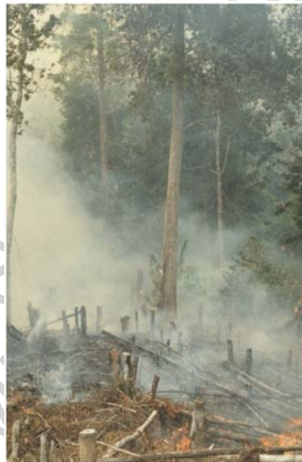
Figure 2. Traditional small-scale slash-and-burn agriculture fire in the lowland equatorial rain forest of East Kalimantan (Indonesia).

The use of fire in the tropical rain forest is an old cultural practice of all human populations living in the equatorial zone (Figure 2). Traditional slash-and-burn agriculture or shifting cultivation , practised by small-sized human populations, are potentially sustainable systems for utilizing the land and the fire effects (clearing, fertilization by the ash) for transitory production of crops on small and temporary sites. The present escalation of burning activities, however, is leading to an aggregation of burned forest patches. This causes manifold environmental problems, e.g. the loss of biodiversity, decrease of site productivity, heavy erosion processes and large-scale air pollution.