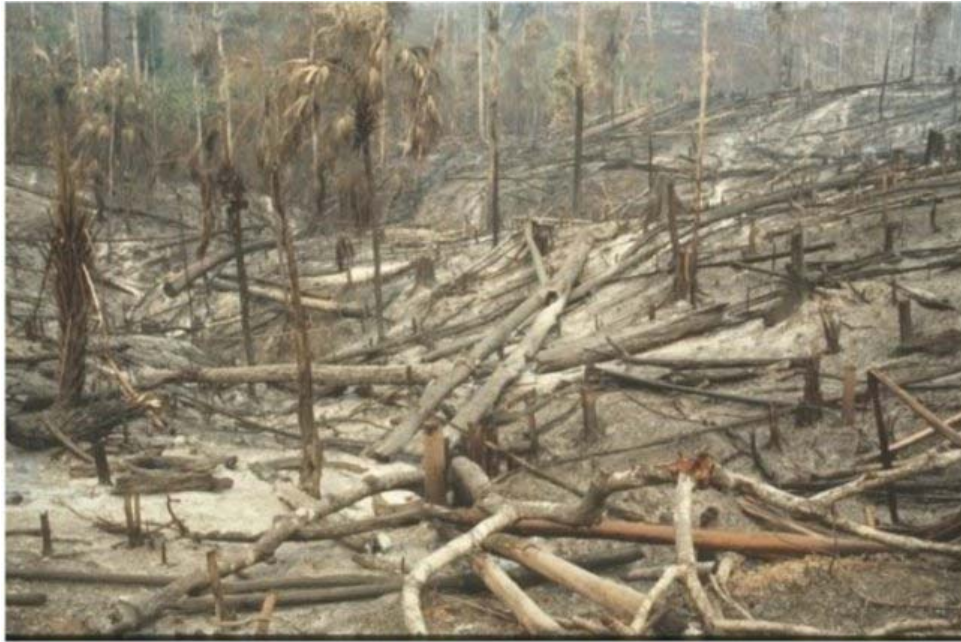
Figure 3. Effects of a forest-conversion fire after clearcutting in a lowland dipterocarp forest of East Kalimantan (Indonesia). Only a small part of the wood biomass is utilized, and the remainder is burned. Ignition and combustion of heavy logs under average conditions of humidity and fuel moisture content is extremely difficult. The logs, which were not affected by fire, decompose in the following years (Photo: J.G.Goldammer).

The wilful application of fire for forest conversion and other land clearing purposes (Figure 3), although causing environmental damages, at the first hand may not necessarily be defined as a disaster in the classical sense. However, the recently observed large-scale wildfires occurring in the wake of forest conversion activities show that more and more human-caused fires in the rain forests are getting out of control.