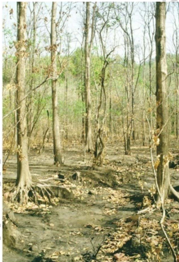
Figure 5. Teak ( Tectona grandis ) plantation in the State of Uttar Pradesh (India) annually burned by surface fires. The fires leave the teak trees largely unaffected and eliminate all competing vegetation. The depletion of litter layer prevents humus layer formation and leads to heavy erosion processes.

The old burning practices of the indigenous human populations were all based on the empiric observations of the beneficial effects of fire, e.g. removal of the dead grasses to stimulate the growth of fresh shoots for grazing, elimination of undesired (economically less valuable) tree species, or facilitation of harvest of non-wood forest products like fruits, flowers, honey and cigarette-wrapping leaves.