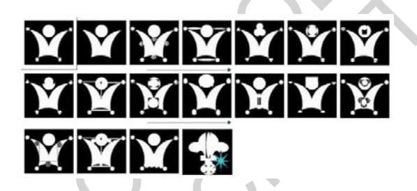
Figure 2. Example showing retrieval of logos.

This section looks at some interesting applications of the concepts just discussed. We look at diverse applications that will illustrate few of the methods that are used in current state-of-the-art systems. The first application involves searching for logos. This is followed by a personal image collection browser, wherein a person may need to retrieve some specific image(s) from his/her personal image collection. The third application could be useful to architects/designers to help them retrieve images of buildings or architectural monuments.