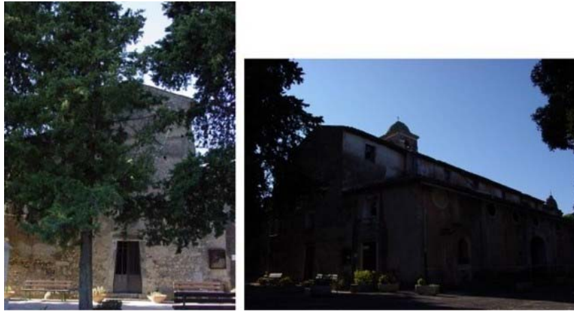
Figure 2: S. Francesco in Palombara Sabina (Rome), example of “reuse”: the convent’s church became the cemeterial church. One of the side naves is used as an ossuary by eliminating the interior nave and opening up an access on the external side.