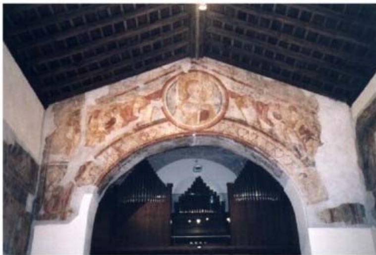
Figure 1: S. Maria in Monte Dominici in Marcellina (Rome), an example of “reversal” of the church: the original plan of the church was inverted in the 17 th century placing the current entrance to the church where the apse once stood. The arch, that today marks the boundary of a sort of “endonarthex”, was the triumphal arch in front of the presbytery.