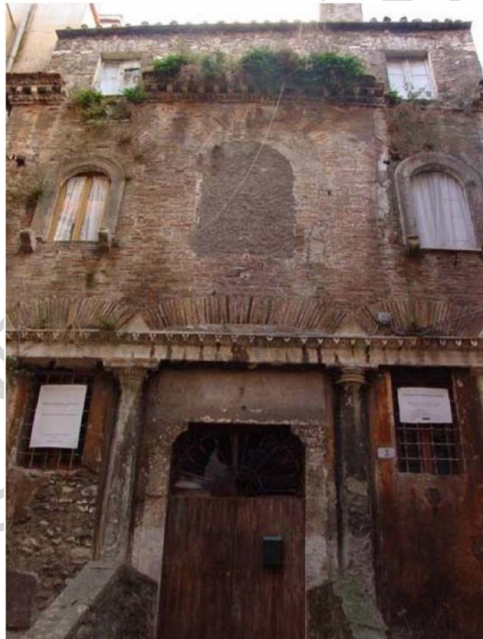
Figure 3: S. Stefano dei Ferri in Tivoli (Rome), example of an object that has been completely transformed from its original use until its present state of distortion and semi-abbandonment. Traces of 5 th century Roman pre-existence can be seen in the stratifications upon which a Medieval plan was built that was in turn altered by further modifications.