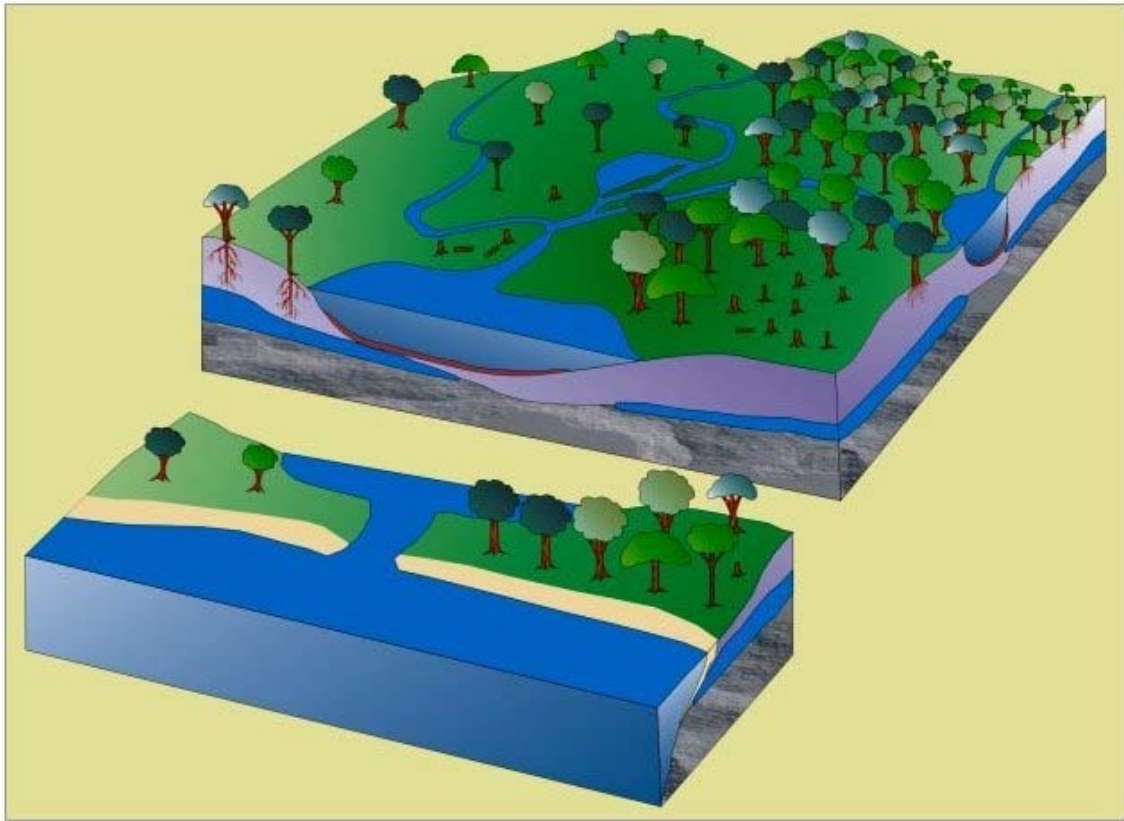
Figure 2. Tropical zone represented as a complex mosaic of ecosystems.