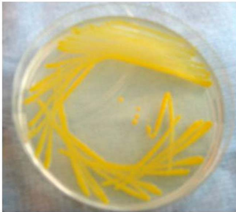
Figure 2. Pure culture of Micrococcus luteus on nutrient agar. A dilution streak was performed for inoculation to obtain single colonies.

We can easily see how such seemingly simple technological developments were groundbreaking in increasing microbiological knowledge. Without pure cultures Robert Koch in the late 19 th century could have never developed a scientific approach (now called Koch's Postulates) to demonstrate that a certain microorganism is the causative