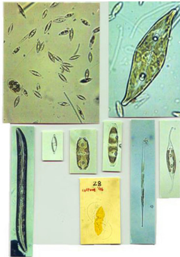
Figure 2. Light micrographs and sketches showing some of the diversity of microphytobenthos in a small sample of the surface of intertidal cohesive sediment. Eight different species of diatom are shown with varying morphological features but similar functional roles.

This varied group of microbial eukaryotes have been used to investigate simple biodiversity/functionality questions in ecology and ecosystem response (Defew et al. 2002, Hagerthey et al. 2002). These cryptic forms highlight the problem that research on “biodiversity” rarely concerns the total diversity of the system but is usually biodiversity in the “eye of the beholder” (Bengtsson, 1998).