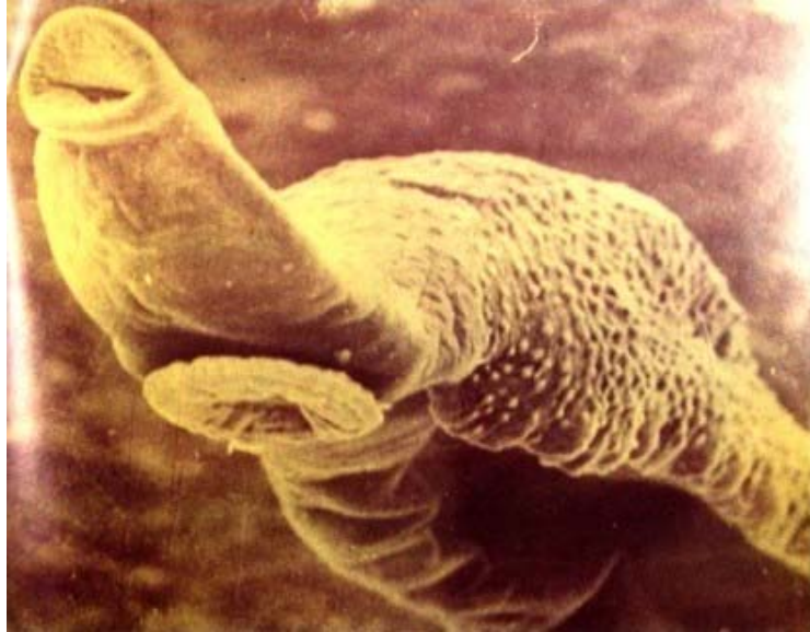
Figure 1. Bilharzia worm (Male) as appeared enlarged Thousands times by the scanning Electron Microscope, showing its two suckers and the ventral groove.