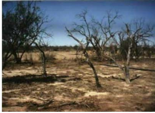
Figure 2. Total area of irrigated land - Dryland salinity is a creeping menace. As the water table rises trees die and salt begins to accumulate on the soil surface.