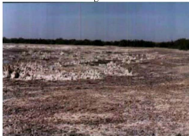
Figure 3. Salt-affected land showing large white accumulations of salt.