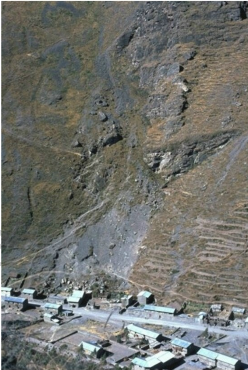
Figure 1: Landslide damage to houses and a road in the Andes of Southern Peru It should be noted in passing that the concept of exposure is different in the insurance

stretch of road that is threatened with rockfalls, this person's exposure to the risk of being hit by falling rock, or driving into fallen rocks, is 10 \times 5 \div 60 \div 24 \div 7 = 0.005 of the week, which expresses the vulnerability of an element at risk per unit time, but not the degree of risk. If a householder can expect to suffer landslide damage once in a lifetime, then he or she bears a risk of approximately 1/80\text{yr} (0.0125 year), which can be described, again by analogy with nuclear radiation measurements, as the dose rate, or impact per person (or per house). Where landslides occur every winter during the season of greatest precipitation, the dose rate for buildings, roads or agricultural land can be quite high (Figure 1).