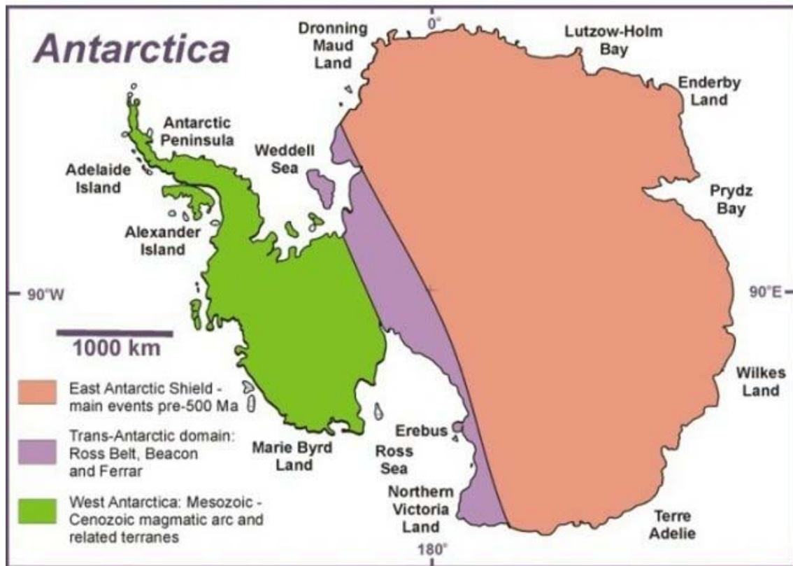
Figure 1: Antarctica, showing its broad division along the Transantarctic Mountain / Ross Sea / Weddell Sea region into the older East Antarctic Shield (pink) and the generally younger West Antarctic domain (green), which consists of a collage of microcontinental blocks and the magmatic arc of the Antarctic Peninsula. The intervening strip distinguished by the purple colour represents the region dominated by the Cambro-Ordovician Ross Orogen, the Devonian-Jurassic Beacon Supergroup sediments and the Jurassic Ferrar large igneous province. The South Pole is indicated by the cross symbol in East Antarctica.

At its most general level the geology of the present continent can be divided into two broad realms (Tingey, 1991 a, c ). East Antarctica is largely covered by the main polar ice cap and is bounded seawards by the long semi-circular coastline that extends from about 20°W through to 160°E and lies at between 66°S and 70°S for much of its length. East Antarctica is bounded to the west by the Trans Antarctic Mountains (TAM), a major mountain belt some 3000 km in length that rises to over 4500 metres in height (Fig. 1).