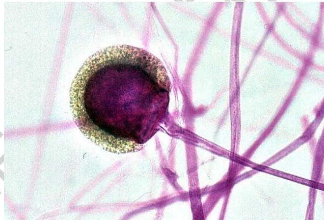
Figure 3. Sporangium of Rhizopus (Mucorales, Zygomycota), which contains sporangiospores, haploid asexual spores, surrounding the enlarged columella at the tip of a long stalk.