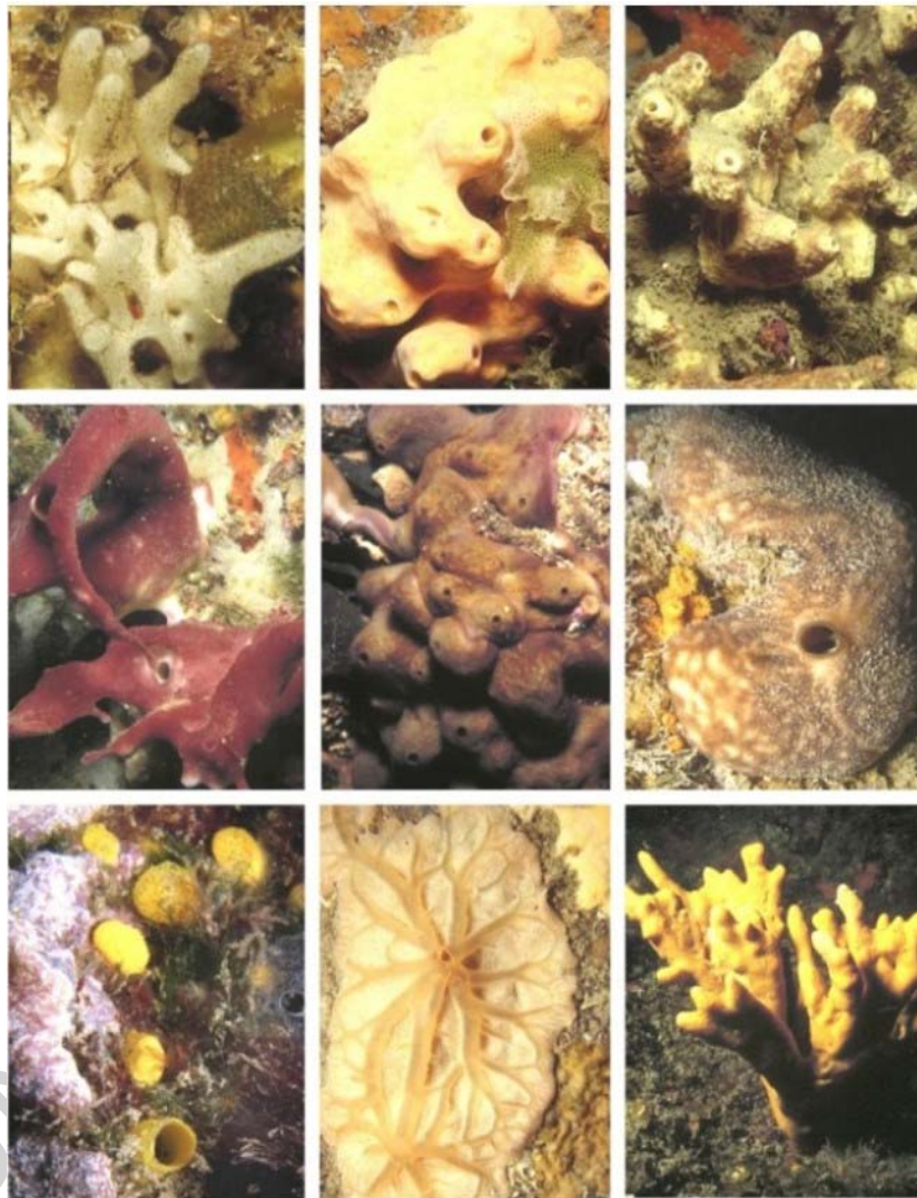
Figure 1. Growth forms in marine sponges.

association with other organisms, especially bacteria. Endosymbioses produce relevant effects on the morphology, physiology, and ecology of sponges. The occurrence in sponges of homeobox and other genes similar to those present in higher animals, such as mammals, but with different functions, indicate that they are also interesting for molecular biology study.