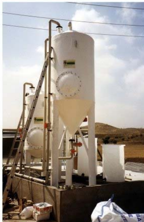
Figure 2. Two views of an industrial solar photocatalytic treatment plant setup (Madrid, Spain, 1999)