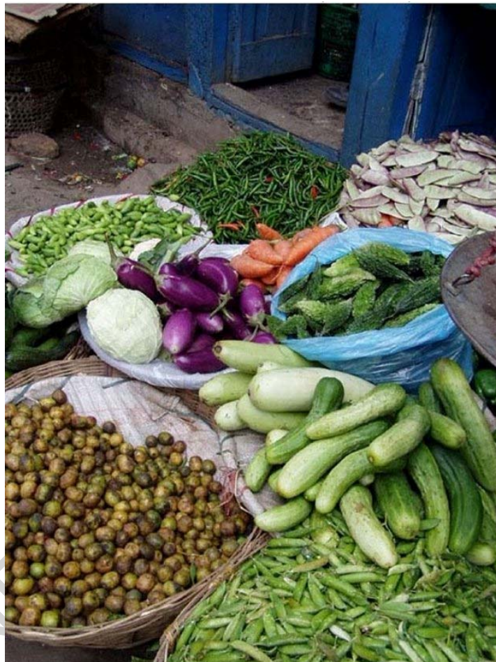
Figure 1: Vegetables marketed in Katmandu, Nepal.

In a practical point of view vegetables are grouped according to the plant part, which is consumed. Some properties, role in nutrition, production and processing of vegetables produced for roots, tubers, leaves, stems or metamorphosed stems are the subject of the Article 5.5.2.3.1. in this volume entitled “Vegetables: Rootcrops”.