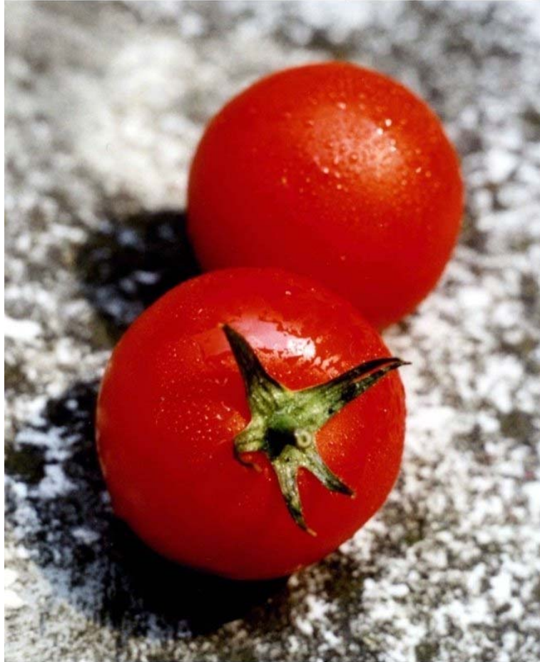
Figure 3: Tomato for salad

Tomato fruits are more or less spherical, red or yellowish berries (Fig. 3.) with various sizes, from the smallest “cocktail” varieties to the biggest ones produced for food industry.