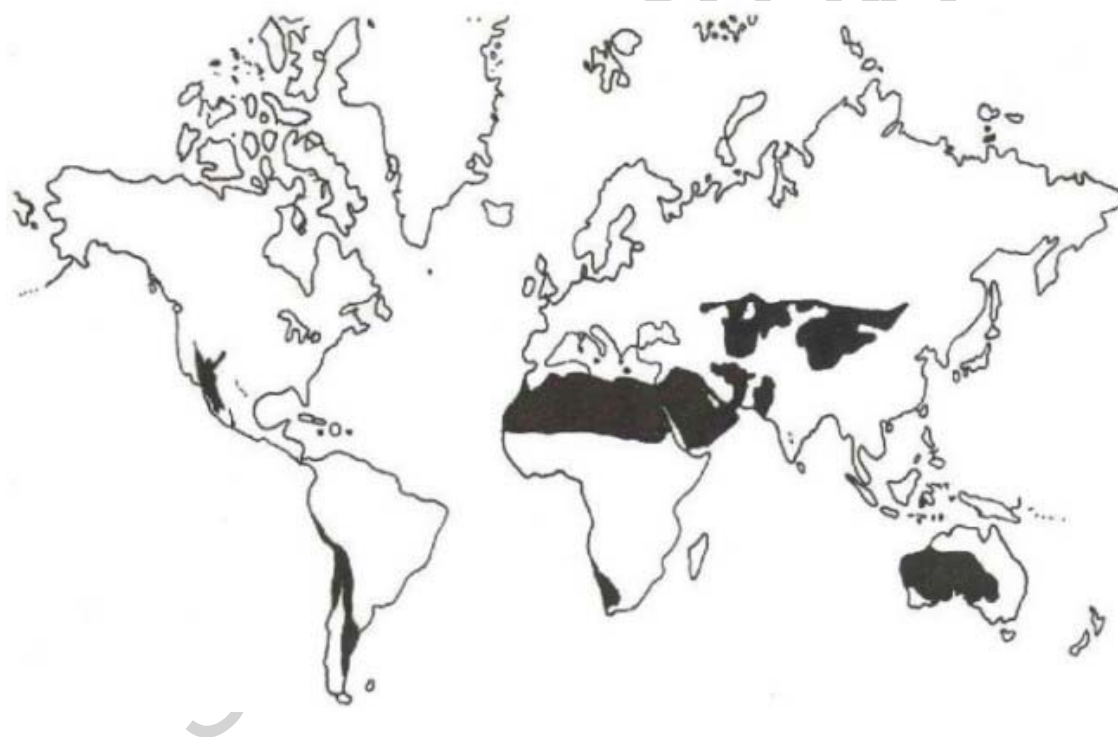
Figure1 Arid zones of the world

Arid zones are located in almost all the continents of world (see Figure 1). In North America, arid zones are found in the southern US and Mexico, and in South America they are located in Brazil, Argentina, Chile, and in some other countries. In Africa, substantial parts of Saharan Africa, Ethiopia, and Namibia, are classed as arid environment. In Saudi Arabia, Iran, and other West Asian countries, large areas have an arid environment, and in South Asia arid zones are located in parts of the Indian subcontinent. Australia has a large arid zone area. In addition to the hot arid zones, larger parts of Tibet and Mongolia; parts of China, and countries of the central Asian region (especially the republics of the erstwhile USSR), and extreme northern parts of India and Pakistan, have cold arid environments. Cold arid ecosystems have unique features and unique problems.