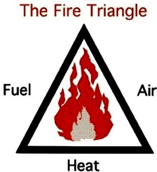
Figure 1. Basic fire triangle.

In order for fire to occur there need to be three elements present: fuel, oxygen and sufficient heat. These components together are often referred to as the basic fire triangle (Figure 1). By adding one more component, containment, a fire can lead to an explosion.