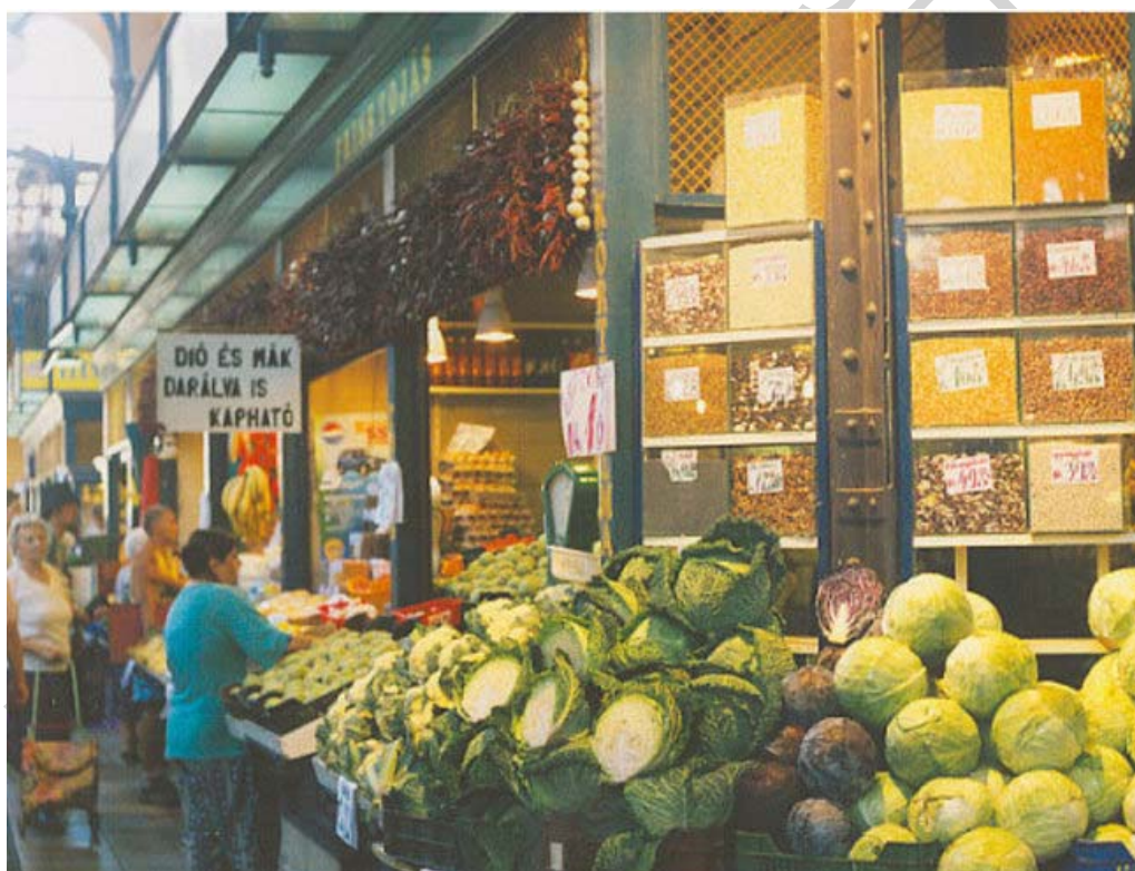
Figure 2: Vegetables in a market in Budapest, Hungary

In standardization of quality grades in the point of view of the practical marketing of vegetables, generally visual attributes, size (or weight), shape and colour and, “freshness” are the main basis of commercial criteria. Category limits for the various products are more or less tailored to the nutritional values, rejecting both the too small and the oversized products. Vegetables must be attractive for the eye of the consumers. Nice shape, firmness, beautiful colour and healthy skin, free from scares, spots, rust, cracks and other skin faults, no frost damaged, etc. are wanted when choosing our food.